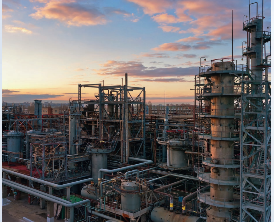
R134A-Freon is a widely used refrigerant, but a very challenging fluid for seals

Two weeks after commissioning the magnetic coupling failed. They didn't withstand the poor lubrication in conjunction with the contaminating particles. A quick solution was needed. It was therefore decided to remove the pump from the system and replace it with a stand-by-pump equipped with the pusher seal H75VN from EagleBurgmann. However, the stand-by-pump was not originally equipped for such a cooling process,